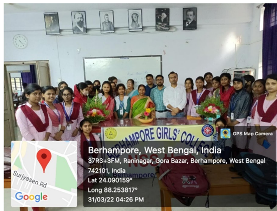
Fig 4. A group photo after completion of the programme