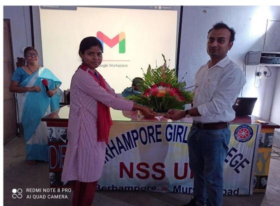
Fig 3. Felicitation of the speaker