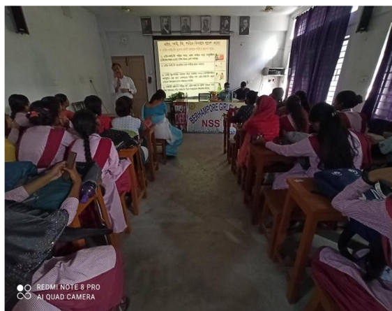
Fig 1 An Awareness Camp on HIV/AIDS

An Awareness Camp on HIV/AIDS held on 31.03.2022 organized by NSS Unit, Berhampore Girls' College in collaboration with Murshidabad Medical College in the College Premises.